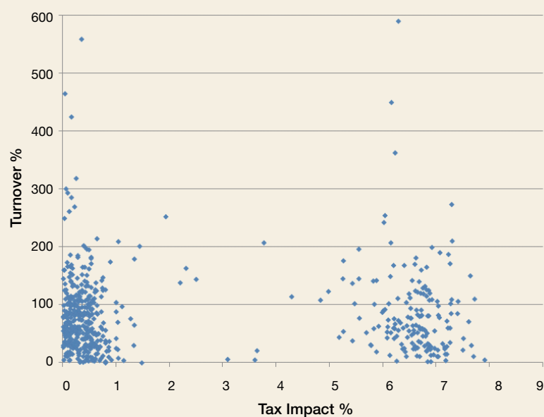
FIGURE 2: TURNOVER IS NOT A GOOD PREDICTOR OF TAX EFFICIENCY, 12 MONTHS ENDING JUNE 30, 2010 (550 ACTIVE FUNDS)

Source: Parametric, based on Morningstar data