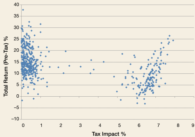
FIGURE 1: ONE IN EVERY THREE FUNDS IS EXTREMELY TAX INEFFICIENT, 12 MONTHS ENDING JUNE 30, 2010 (550 ACTIVE FUNDS)

Source: Parametric, based on Morningstar data